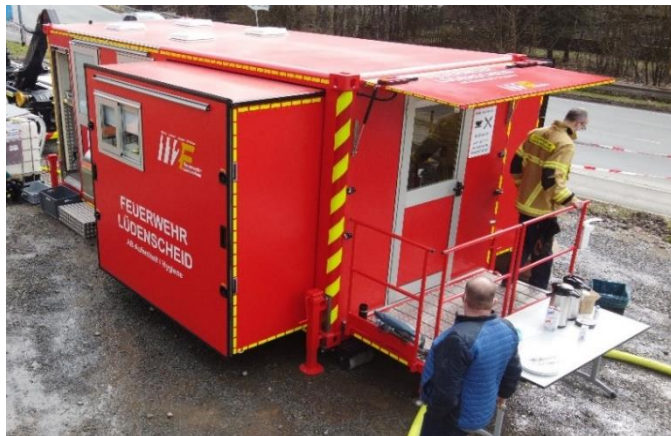
View of the entrance of the meeting room – with extended side bodies