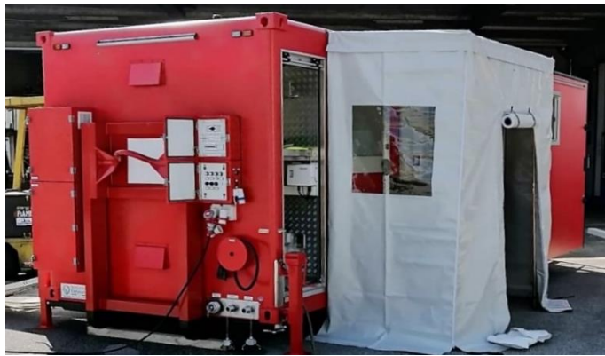
Front view of equipment area and awnings for toilet and changing area