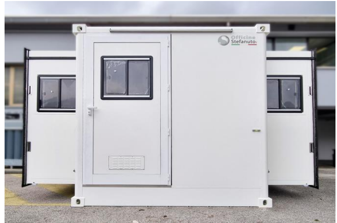
View in “extended” operating position