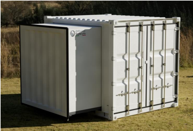
View in extended operating position

DIVISION FIELDLOGISTIC | DATASHEET 24.15 | MOD. CON10-1GV-LAB-FE