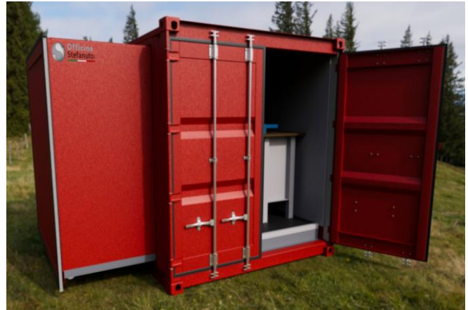
View of the entrance in an extended position